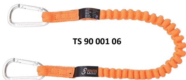
TS 90 001 06