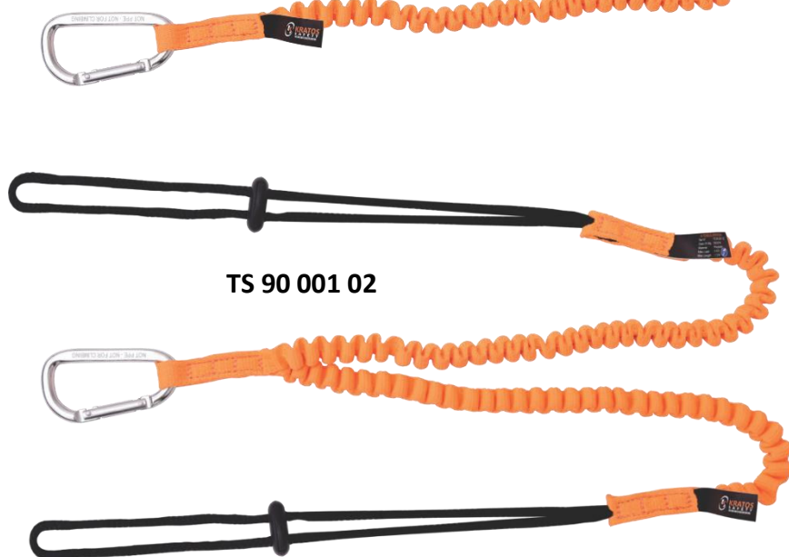
TS 90 001 02